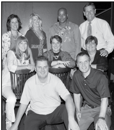
A group of attendees enjoys a moment together at the annual CMSA Conference & Expo.

SUPPORTING THE DEVELOPMENT OF CARE MANAGEMENT PROFESSIONALS.